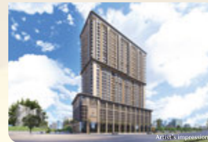
ALTAVISTAS - LOKHANDWALA