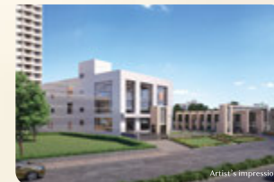
ECO BUSINESS PARK - SHILPHATA MAHAPE