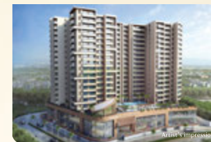
SKYVISTAS - ANDHERI (W)