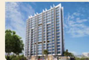
ASBURY PARK - KANDIVALI (W)