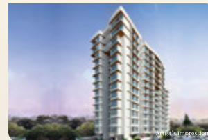
PARKVISTAS - ANDHERI (W)