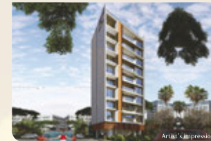
JUHU VISTAS - JUHU