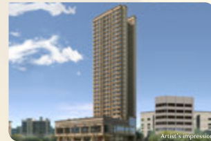
ARIZE - GOREGAON (W)